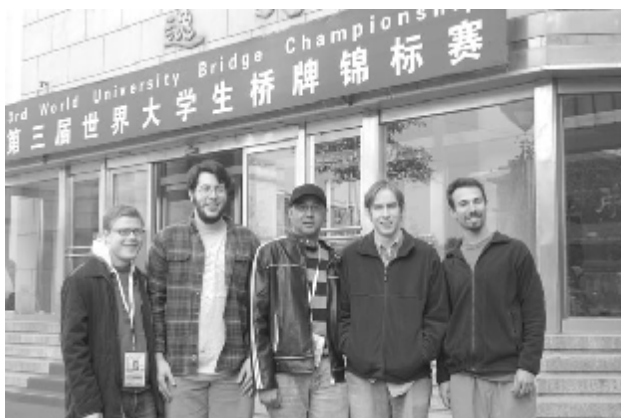
1 st Runner-up: USA Team