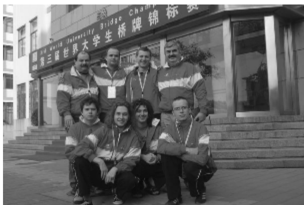
2 nd Runner-up: Poland B Team