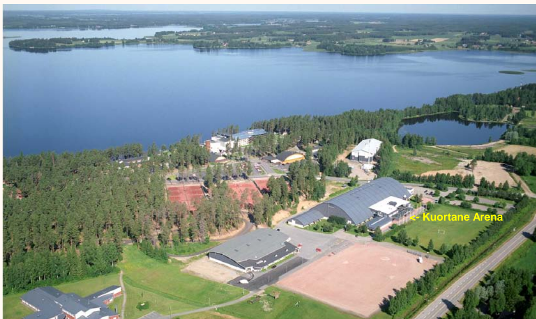
The Campus Area of Kuortane High Performance Training Centre

MEDICAL Doping controls will be organized during the tournament by the Finnish Antidoping Agency in accordance with FISU and FILA guidelines.