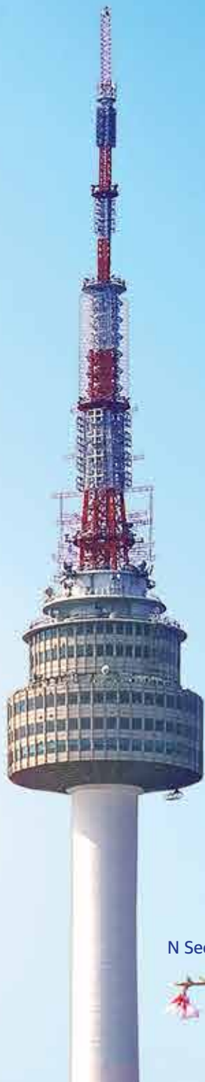
N Seoul Tower