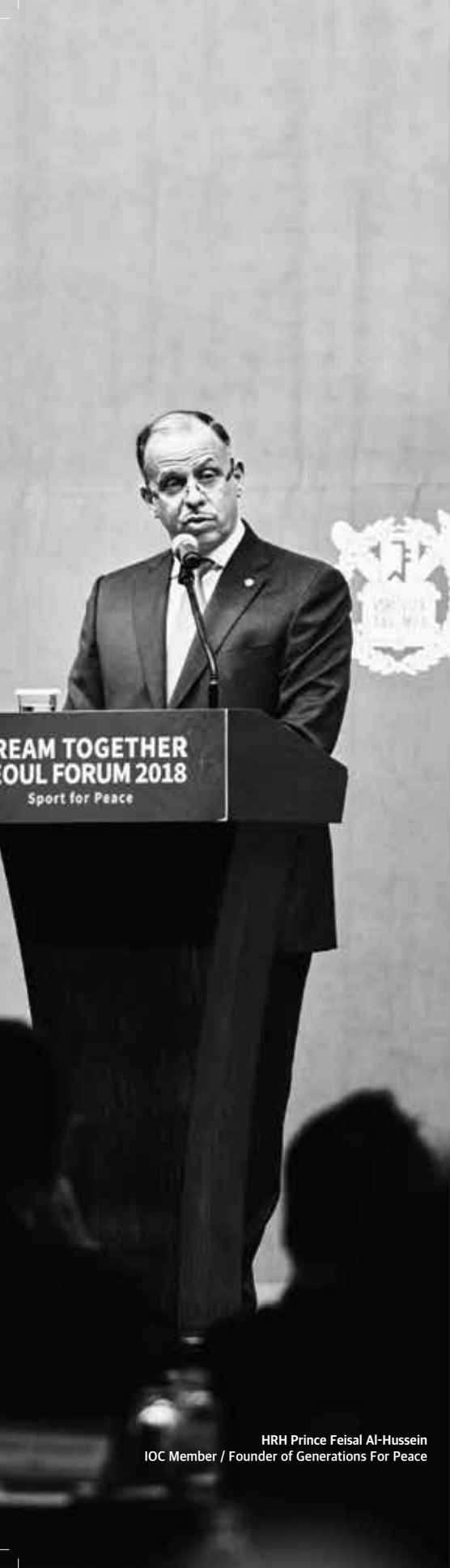
HRH Prince Feisal Al-Hussein IOC Member / Founder of Generations For Peace